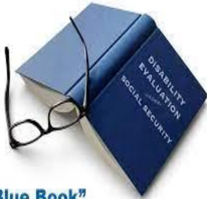
The “Blue Book”

For disability eligibility, you must meet “SSA Blue Book” listing of impairments.